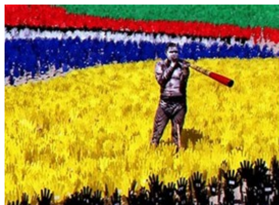
Photos taken from the smoking ceremony held 4th May 2022

To acknowledge the Sea of Hands, a prominent Australian symbol used to support Aboriginal and Torres Strait islander land rights, our preppies will be engaging in decorating the aboriginal flag with their hands in red, yellow and black paint. We will also be holding a small flag ceremony at the front of school (flags to be flown at half-mast).