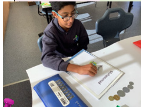
Sonny and Muhammad learning with money activities