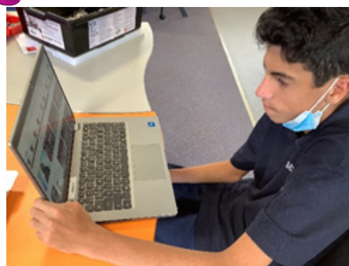
Cosmo learning with seesaw activities