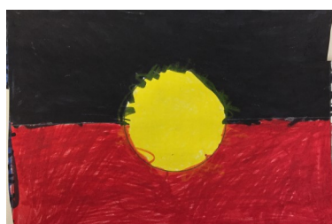
Harmony - MDL