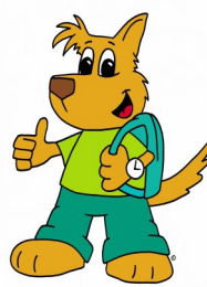
Ringo is Responsible