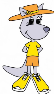
Sue is Safe