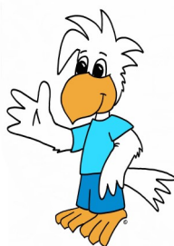
Rocky is Respectful